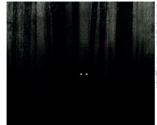
Porth Llywd Episode 1: "The Ogglesprott"