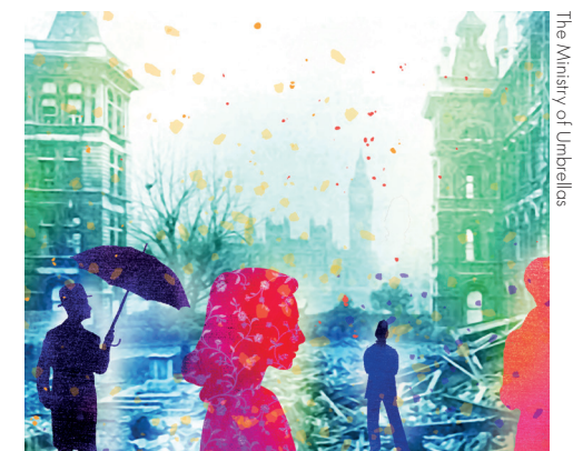
The Ministry of Umbrellas