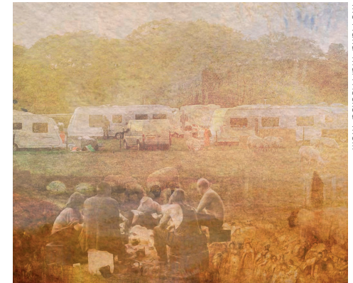
The Hand That Mocked Them