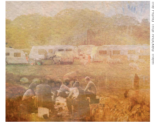
The Hand That Mocked Them