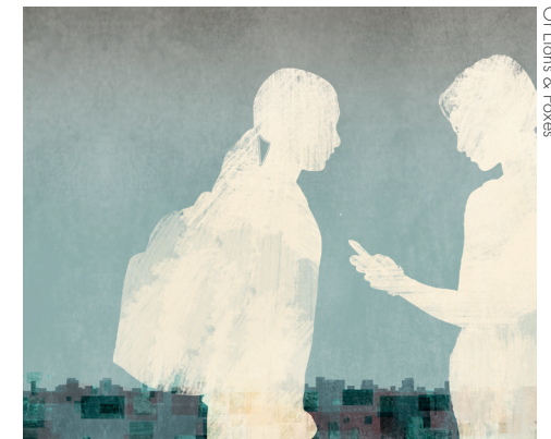
Of Lions & Foxes